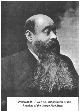
President M. T. STEYN, last president of the Republic of the Orange Free State.