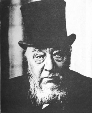
President PAUL KRUGER, last president of the Transvaal Boere Republic.