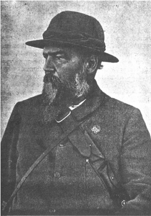
General LUCAS MEYER, President of the Republic of Vryheid that was incorporated into the Transvaal Boere Republic in 1888.